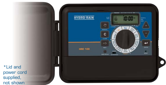
*Lid and power cord supplied, not shown